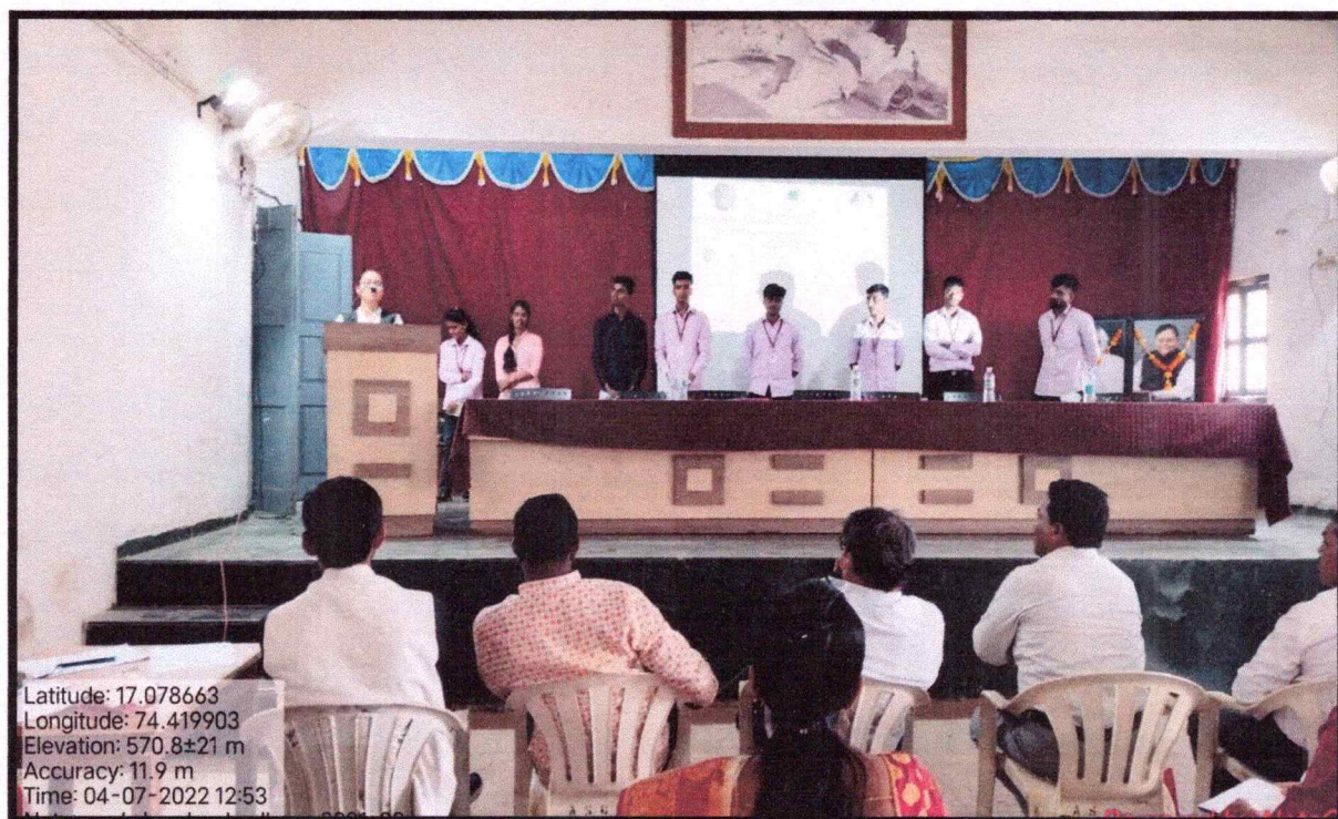
Participation of the students in Anchoring Competition, dated on 04/07/2022.