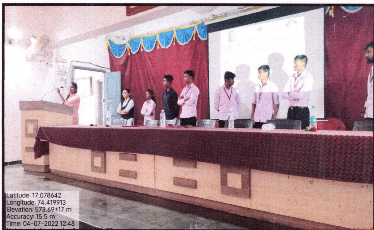
Participation of the students in Anchoring Competition, dated on 04/07/2022.